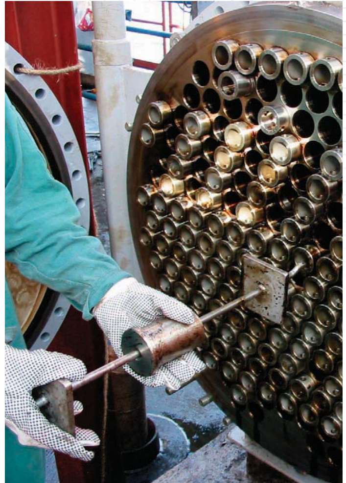
CYCLONIXX® Cyclone Liner Installation into a 36"/ 900 mm Vessel

Normally, system pressure is used to provide the driving pressure, but if too low (<75 psig / 5 Barg), a pump can be used to boost the feed pressure. Typically, single stage centrifugal pumps are used, where pressures are too low.